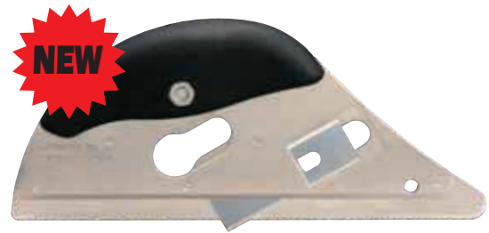
LONGER BLADE REMOVAL HOLES