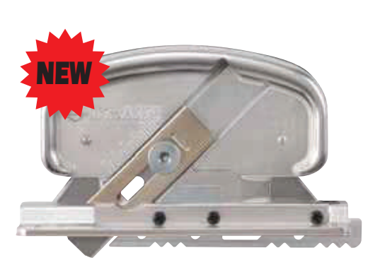
3 in 1 SEAM CUTTER

Order No. Description Weight Blades Cushion Lock Cutter 306C, 308C, 309C